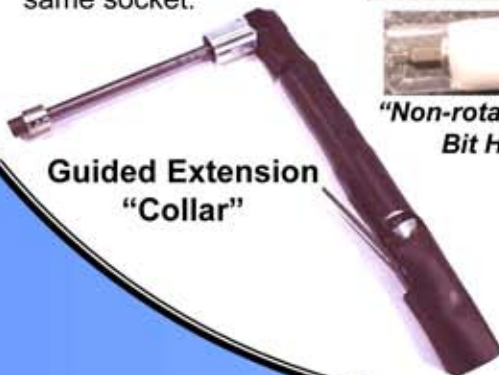
Guided Extension “Collar”