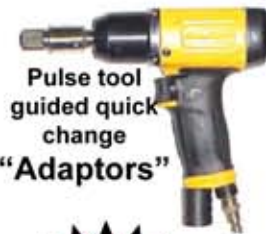
Pulse tool guided quick change “Adaptors”