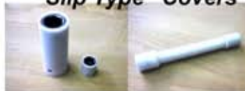
“Slip Type” Covers