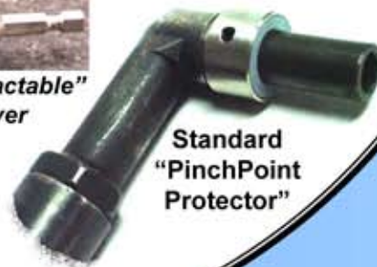
Standard “PinchPoint Protector”

Superior selection, performance and delivery, at reduced cost !