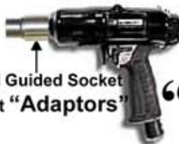
Pulse tool Guided Socket With Socket “Adaptors”